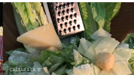
CAESAR A LA "B"