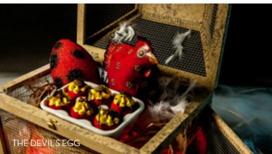
THE DEVIL'S EGG

Current state sales tax 9% and gratuity 20% not included. Menu items are subject to change; restaurant reserves the right to substitute menu items. Pricing valid until December 31, 2019.