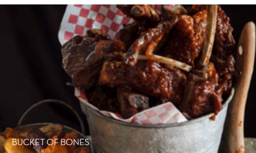
BUCKET OF BONES

Current state sales tax 9% and gratuity 20% not included. Menu items are subject to change; restaurant reserves the right to substitute menu items. Pricing valid until December 31, 2019.