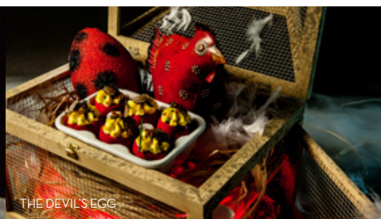
THE DEVIL'S EGG