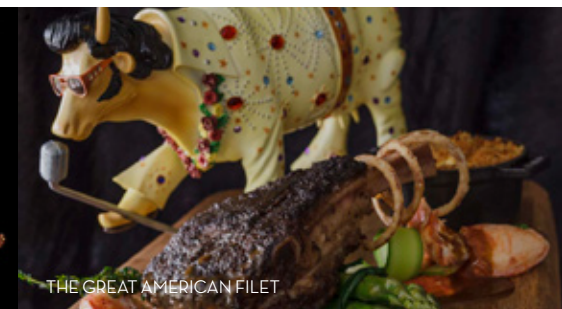
THE GREAT AMERICAN FILET