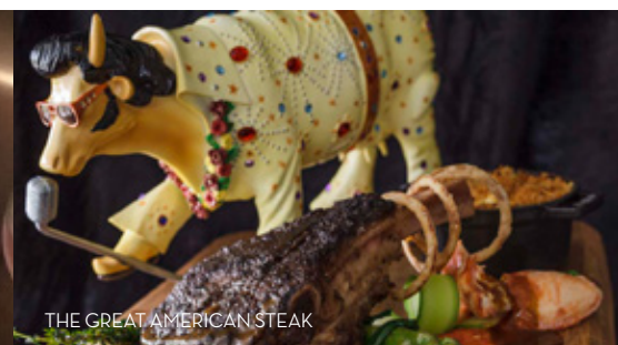
THE GREAT AMERICAN STEAK