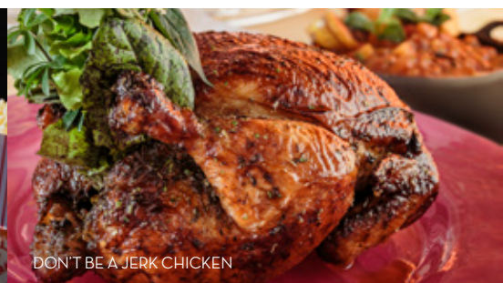
DON'T BE A JERK CHICKEN