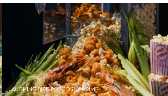
LAUGHING BIRD POPCORN SHRIMP