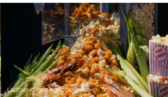
LAUGHING BIRD POPCORN SHRIMP