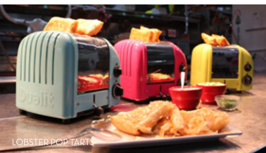
LOBSTER POP TARTS

Current state sales tax 9.5% and gratuity 20% not included. Menu items are subject to change; restaurant reserves the right to substitute menu items. Pricing valid until December 31, 2018.