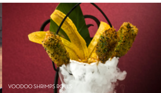
VOODOO SHRIMPS ROLLS